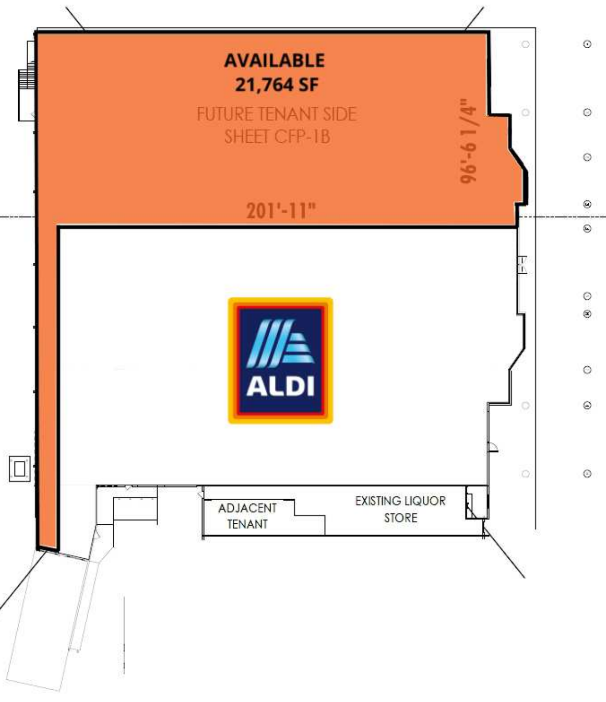
1 Proposed Plan Overview SCALE: 1/8" = 1'-0"